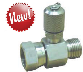
Now available in stainless steel