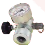
M28x1.5 (with hex pin) Hydac / Parker

(See our PCFPU kit datasheets for further information)