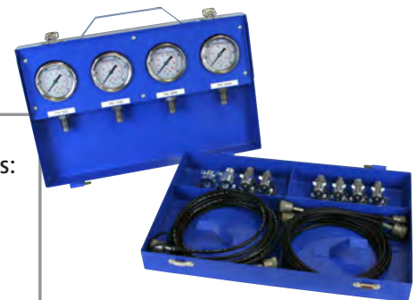
Removable gauge panel for easy transportation around test area

All pressure gauges have dual bar / psi scale. ±1.6% acc. Special gauge ranges available on request