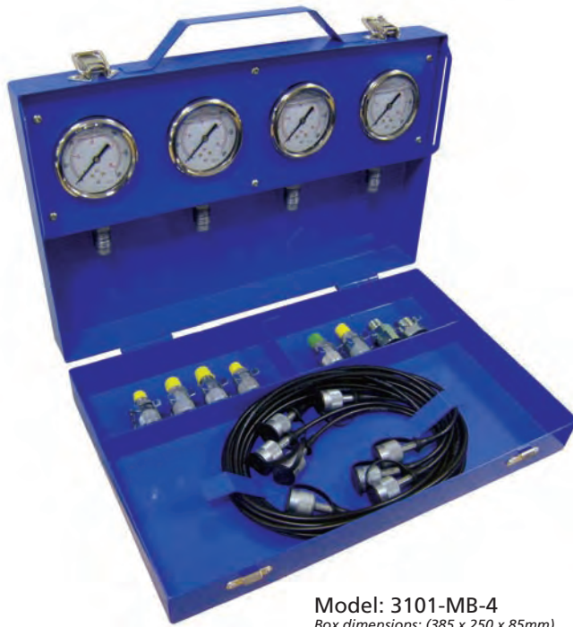
Model: 3101-MB-4 Box dimensions: (385 x 250 x 85mm)