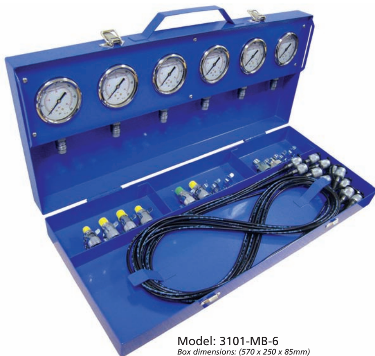
Model: 3101-MB-6 Box dimensions: (570 x 250 x 85mm)