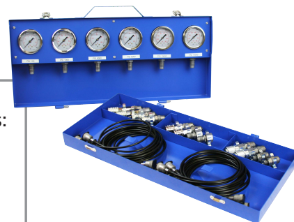
Removable gauge panel for easy transportation around test area

All pressure gauges have dual bar / psi scale. ±1.6% acc. Special gauge ranges available on request