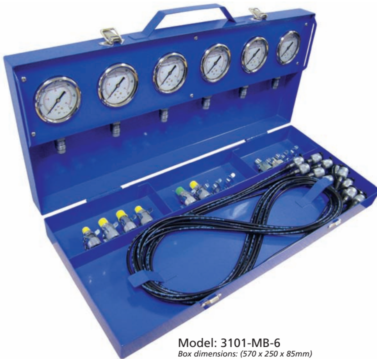
Model: 3101-MB-6 Box dimensions: (570 x 250 x 85mm)